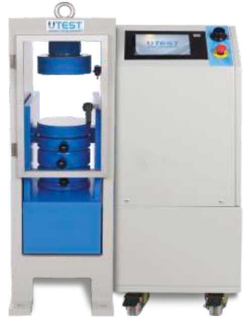
UTC - 4702.FPR