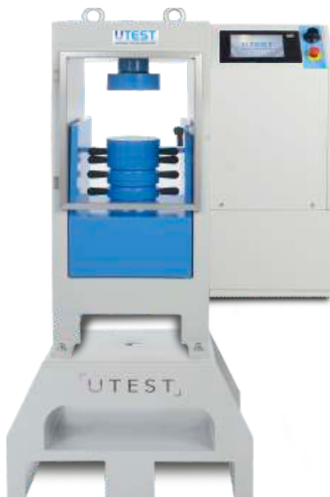
UTC - 4722.FPR