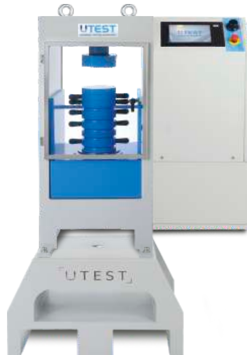
UTC - 4732.FPR