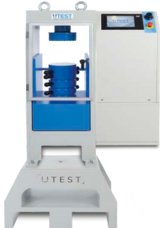
UTC-4712.FPR or UTC-4680

The advantages of performing tests on computer with using UTEST Software, such as reporting, graphical output, etc. can be seen in detail at the USOFT-4930.FPR (The UTEST Software for Automatic Compression / Flexure Testing Machines with UTC-4830FPR Hydraulic Power Pack) pages.